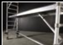
High Clearance Platform